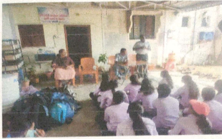
B. Sc. Students participation in the pearl culture training