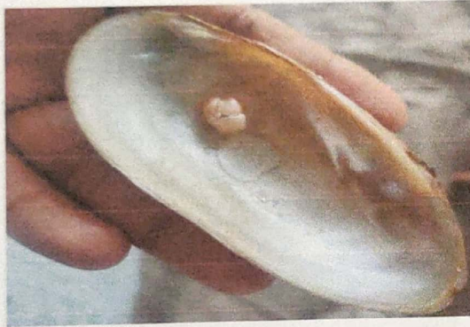
Market grading costing of pearl