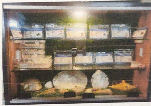
Formation of pearl in shell

[Signature] (Momin A.M.) Incharge of course